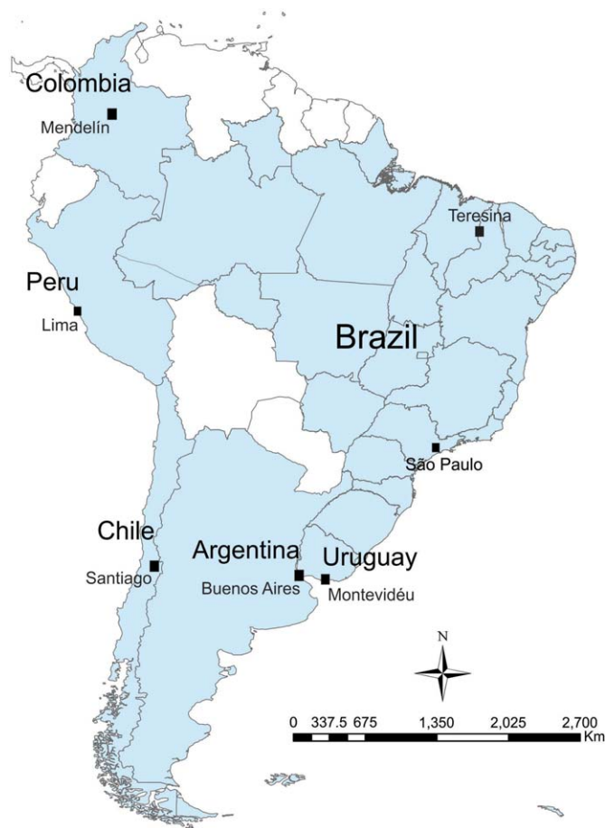
Figure 1 SAYCARE research centers by country.

consent form. Moreover, a signed assent form was obtained from all children and adolescents to indicate their approval to participate in the study.