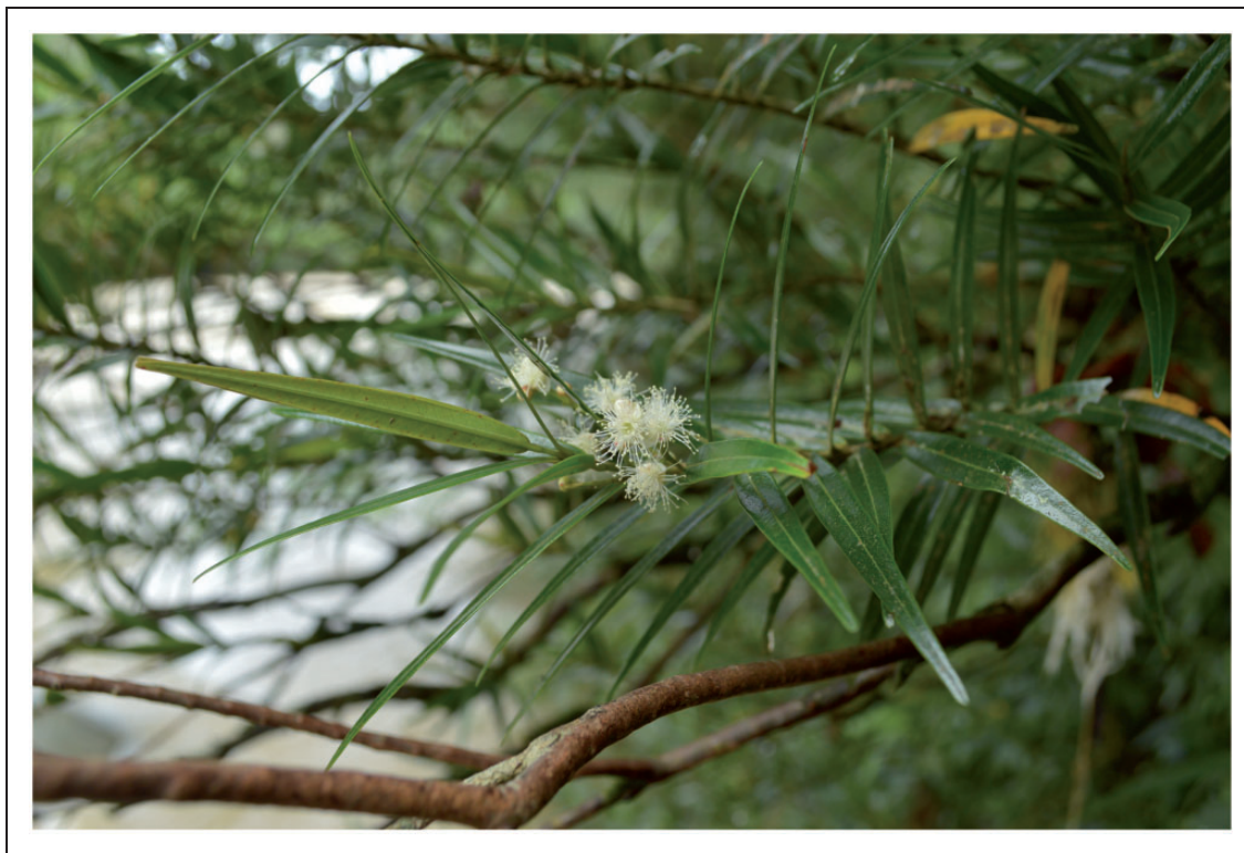
Figure 5. Myrcia sp., a critically endangered new species known only from the Samaná River basin, Antioquia, Colombia, where it has an estimated area of occupancy (EAO) of just 0.61 km 2 . Sixty-eight percent of its population would disappear if the Porvenir II dam were built.

For species found downstream from the dam, the threat is not flooding but a change in the hydrological dynamics of the river, which would deprive the plants from the cycles of flood and drought that have determined their evolution and which probably play a vital role in their reproduction. The Podostemaceae, for example, are known to depend on the periodic occurrence of high and low water levels, developing vegetative structures during periods of flood, and reproducing during the dry season, when the rocks are exposed (Khanduri, Chaudhary, Uniyal, & Tandon, 2014; Mohan Ram & Segal, 2007). Unlike many other aquatic plants, Podostemaceae are not known to propagate by any vegetative means (Philbrick, 1997)