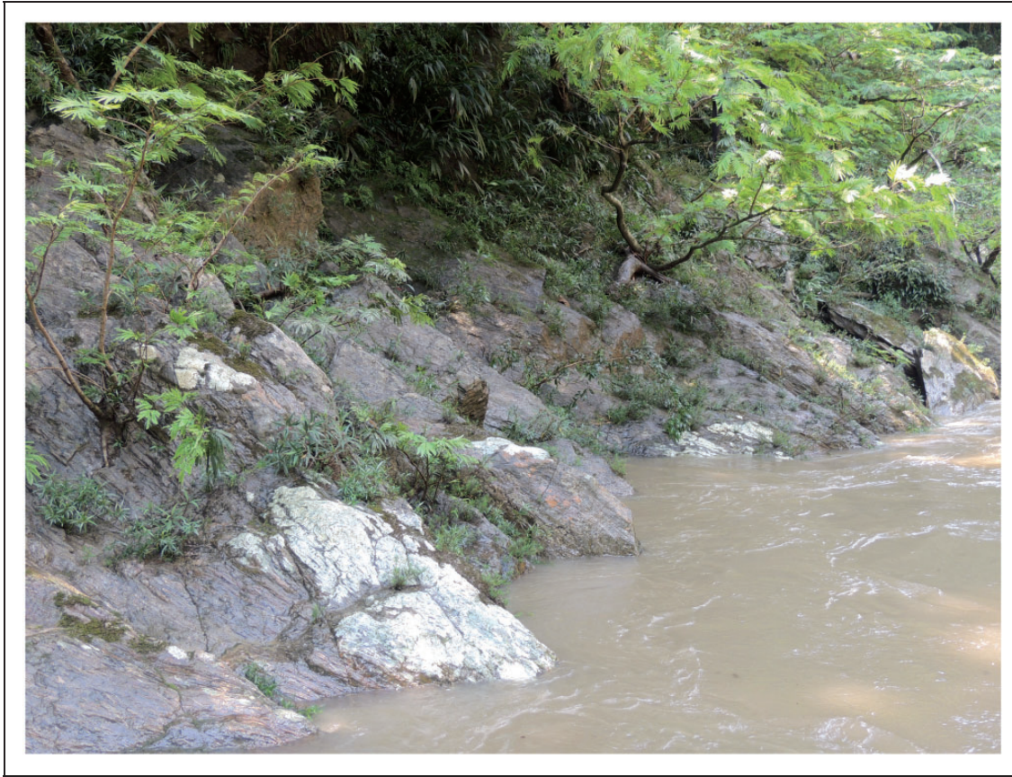
Figure 3. Aspect of a rheophytic community on rocky margins of the Samaná Norte River, Antioquia, Colombia.

identifications were made by specialists (see Acknowledgments). Some of the species that remain unidentified (e.g., Cestrum sp., Eugenia sp., Marathrum spp., Nectandra sp.) represent difficult taxa currently under study by specialists, and some of them may prove to represent additional new species. Other species (like some Marathrum spp.) are represented by incomplete material that makes proper identifications impossible.