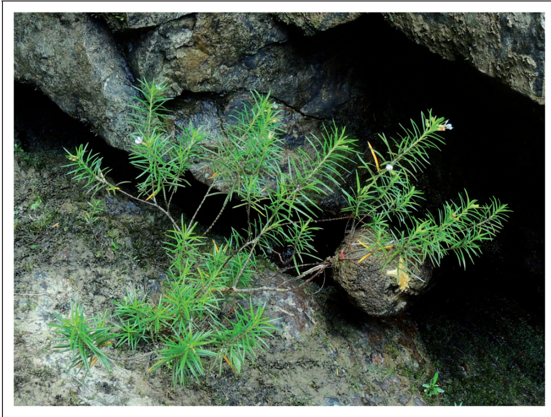
Figure 4. Cuphea fluviatilis , a critically endangered species known only from the Samaná River basin, in Antioquia, Colombia, where it is abundant on exposed rocks. Forty percent of its population would disappear if the Porvenir II dam were built.

places along a tract less than 15 km along the river, growing on rocks at intermediate flood level.