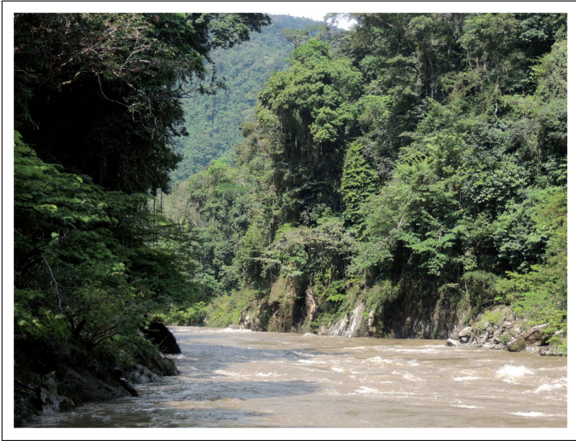
Figure 2. View of the Samaná Norte River, Antioquia, Colombia. This area would be 60 m under water, if the hydroelectric project Porvenir II were developed.

each of the rheophytes. These parameters will be vital for refining the information of the project's environmental impact study, which did not include this critical group of plants.