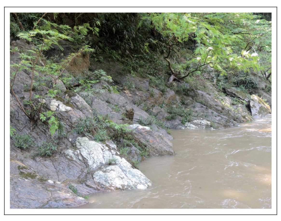
Figure 3. Aspect of a rheophytic community on rocky margins of the Samaná Norte River, Antioquia, Colombia.

identifications were made by specialists (see Acknowledgments). Some of the species that remain unidentified (e.g., Cestrum sp., Eugenia sp., Marathrum spp., Nectandra sp.) represent difficult taxa currently under study by specialists, and some of them may prove to represent additional new species. Other species (like some Marathrum spp.) are represented by incomplete material that makes proper identifications impossible.