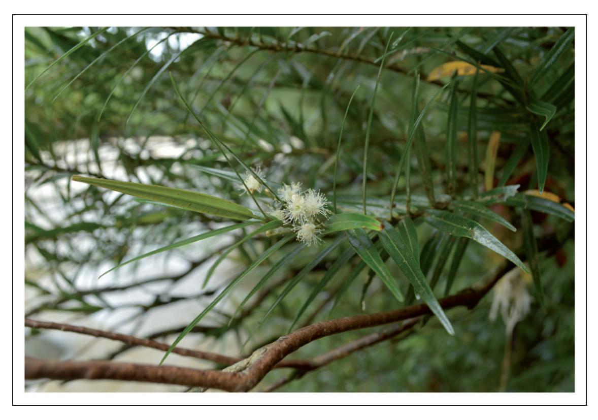
Figure 5. Myrcia sp., a critically endangered new species known only from the Samaná River basin, Antioquia, Colombia, where it has an estimated area of occupancy (EAO) of just 0.61 km<sup>2</sup>. Sixty-eight percent of its population would disappear if the Porvenir II dam were built.

For species found downstream from the dam, the threat is not flooding but a change in the hydrological dynamics of the river, which would deprive the plants from the cycles of flood and drought that have determined their evolution and which probably play a vital role in their reproduction. The Podostemaceae, for example, are known to depend on the periodic occurrence of high and low water levels, developing vegetative structures during periods of flood, and reproducing during the dry season, when the rocks are exposed (Khanduri, Chaudhary, Uniyal, & Tandon, 2014; Mohan Ram & Segal, 2007). Unlike many other aquatic plants, Podostemaceae are not known to propagate by any vegetative means (Philbrick, 1997)