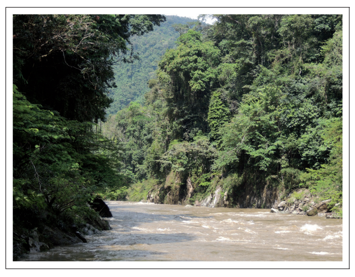
Figure 2. View of the Samaná Norte River, Antioquia, Colombia. This area would be 60 m under water, if the hydroelectric project Porvenir II were developed.

each of the rheophytes. These parameters will be vital for refining the information of the project's environmental impact study, which did not include this critical group of plants.